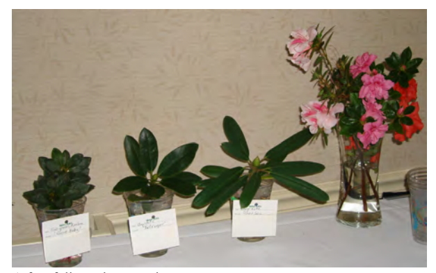
A few foliage show entries