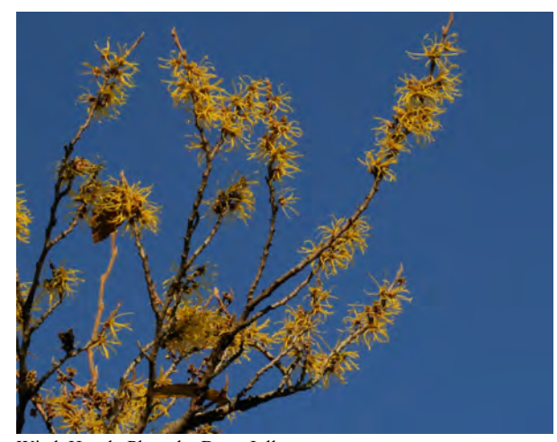
Witch Hazel.

Rhododendrons and azaleas both are heavily budded and waiting on spring. Seed has largely been sparse both here and in some native populations that I have visited. American holly and deciduous holly are heavily laden with berry crops. In May, a male deciduous holly, 'Apollo', was pruned at flowering time. Rather than discard