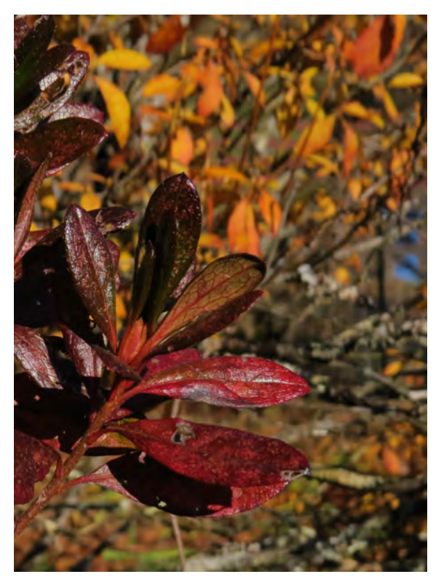
'Girard's Rose' and 'Cornell Pink'.

the freshly pruned twigs, I put several branches in a large vase and placed them beside one of our