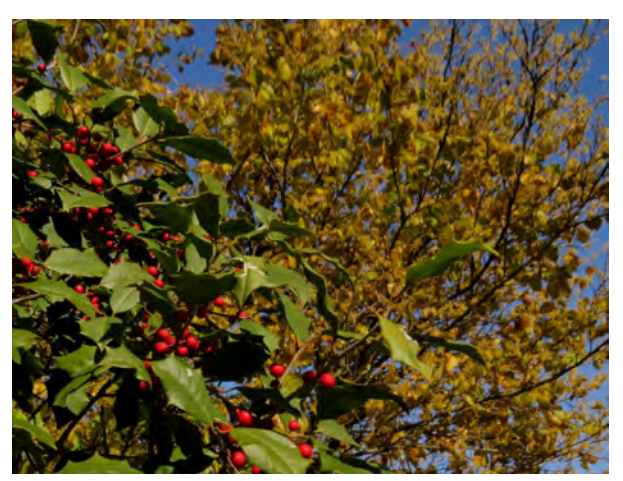
American Holly and Witch Hazel.

Sparkleberries. The resulting berry set was outstanding.