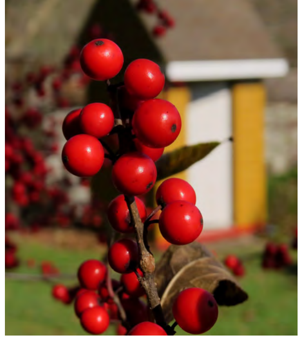
'Sparkleberry' holly.

Sparkleberries. The resulting berry set was outstanding.