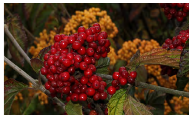
Viburnum 'Cardinal Candy' and 'Michael Dodge'.

The attendees at the MAC fall meeting might wish to revisit Wintergreen during the month of May. The