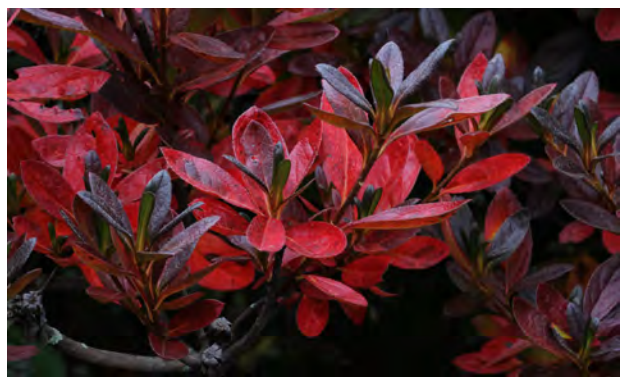
'Girard's Sandra Ann'.

Wintergreen Nature Foundation hosts a wildflower weekend which features talks, walks and demonstrations of all phases of Virginia natural history. The Foundation has a terrific native plant propagation program. Initiated