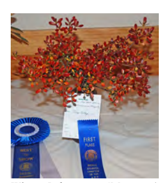
Winner R. kiusianum 'Mangetsu'