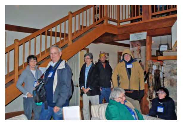
MAC members preparing for hike.