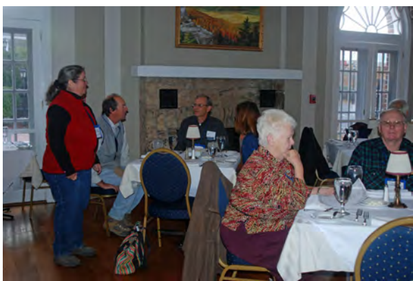
An elegant lunch at Mimslyn Inn.