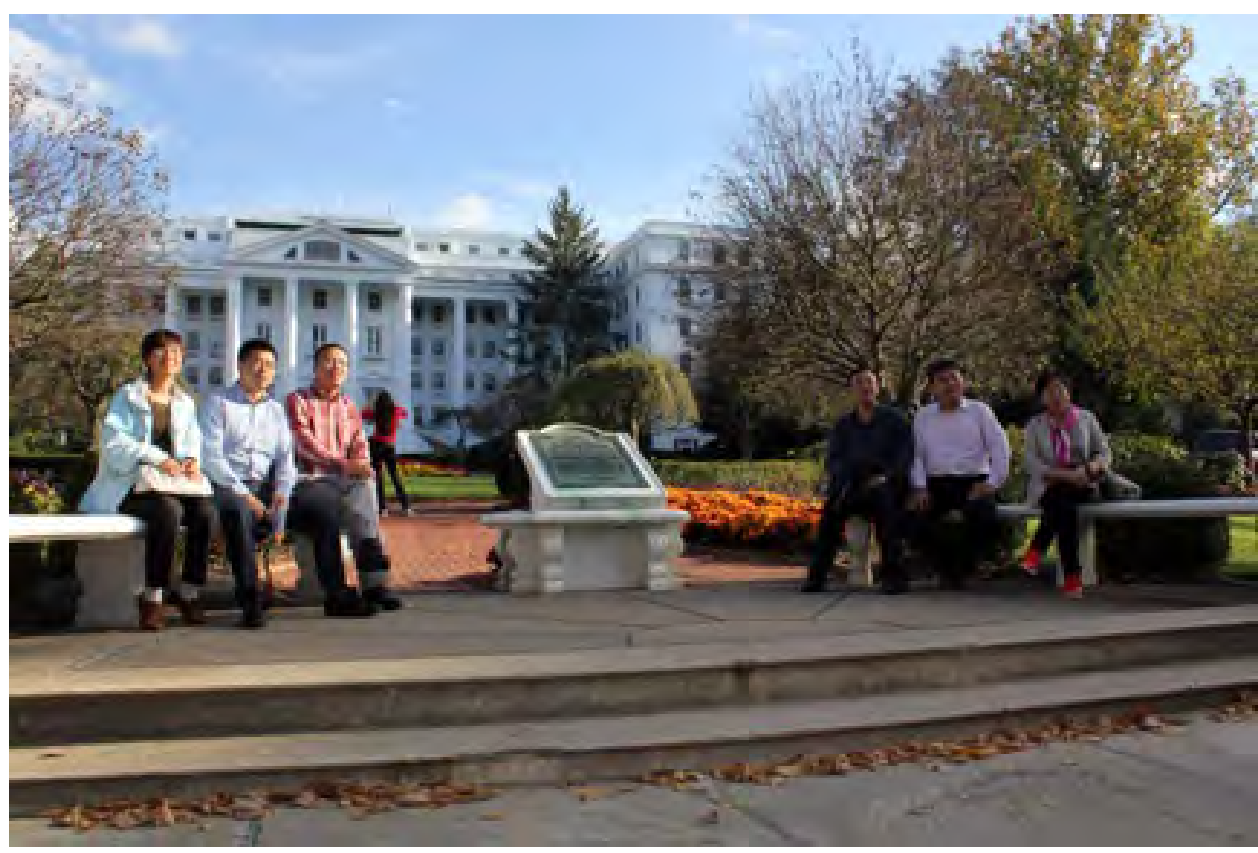
The Chinese delegation at the Greenbrier.