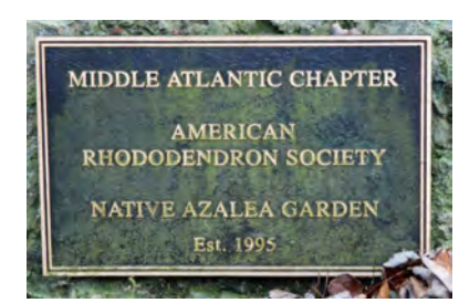
Sign for MAC Native Azalea Garden at JMU.