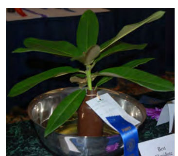
Taurus, the Feller's Best-In-Show winner in the Foliage Show.