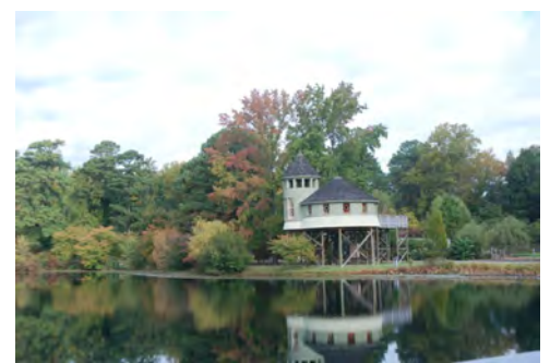
A view of the lake at Ginter Botanic Garden.