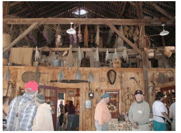
MAC members at shop at Buffalo Springs Herb Farm.