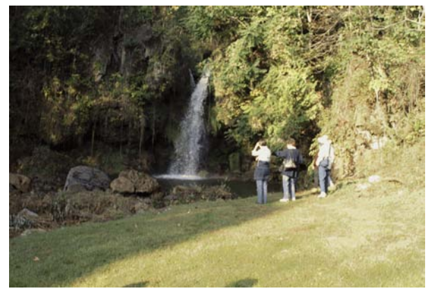
Glen Falls at Helen Chew's garden.

Saturday's tour was exceptional. Four vans were