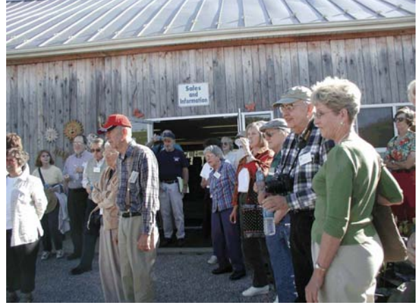
MAC members at SpringDale Water Garden.