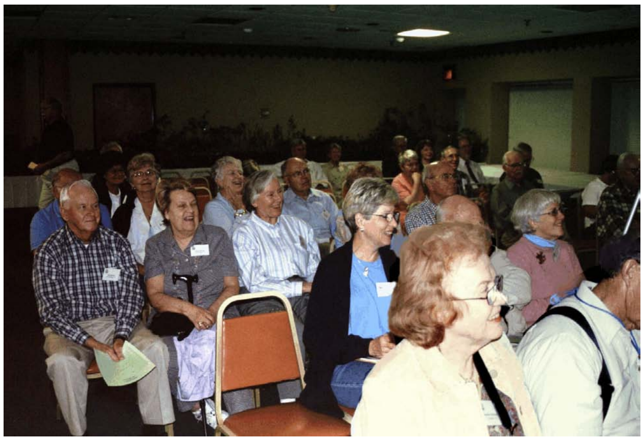
MAC members listening to program at the Fall Meeting.