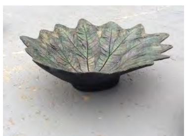
is optional so, if Yungman garden sculpture.

may elect to eat on your own at one of the many nearby restaurants.