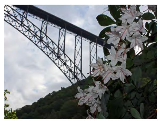
R. arborescens at the New River Gorge.