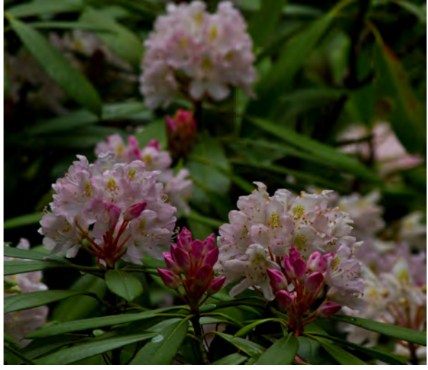
Rhododendron maximum, Cranberry Glades.