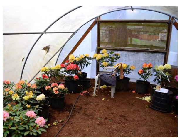
Jim Barlup's hoop house for hybridizing.