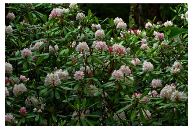
Cranberry Glades R. maximum .