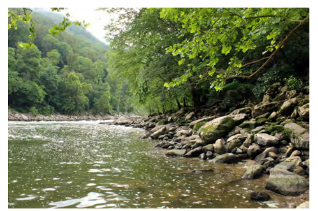
R. arborescens habitat at the New River.