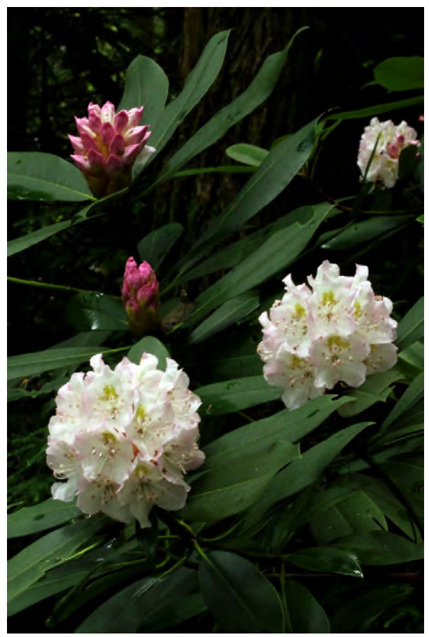
Rhododendron maximum at Hominy Falls on July 1.

The grist mill at Babcock State Park in Fayette County is one of the most photographed subjects in the United States. With streams running full this summer I thought that a photography visit would be in order. While positioning myself on a streamside boulder, I noticed a lone rhododendron seedling growing from a crack in an otherwise barren rock : another example of determination. Also of note is that Rhododendron catawbiense also grows in the park.