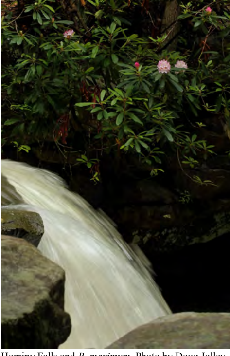
Hominy Falls and R. maximum.