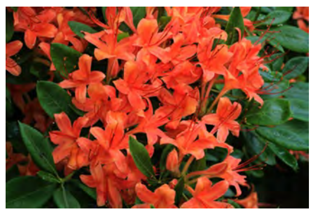
Rhododendron cumberlandense.

great summer to see our summer azaleas at home and on the road.