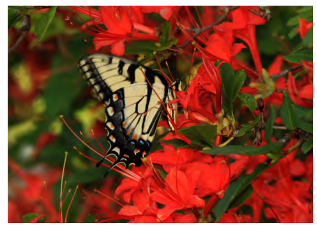
Rhododendron prunifolium and swallowtail butterfly.