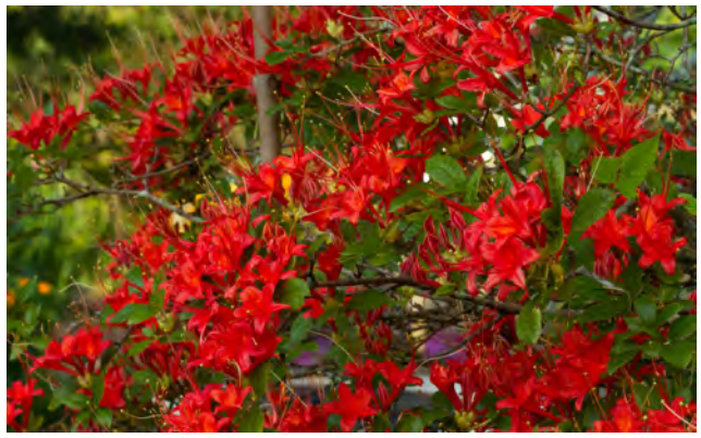
Rhododendron prunifolium.