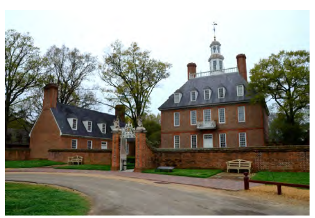
Governor's Palace in Colonial Williamsburg.

As for tours, we will have a lot of flexibility due to the location. We do expect to showcase local projects