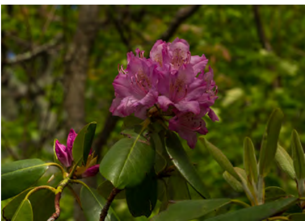
Rhododendron catawbiense at Wintergreen.