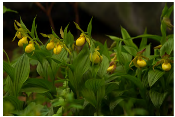
Yellow lady slippers.

Davetta's and my efforts at growing native azaleas are drastically diminishing. We are converting growing beds to blueberries. Strawberries serve as their companions. Also, we spent the fall and winter drastically cutting down shrubs, trees, limbing up trees and having continual hot dog roasts from the resulting bonfires. We are restoring views out from the garden and letting light in for the remaining plants. Five years without deer (from a successful fence) resulted in a vegetative