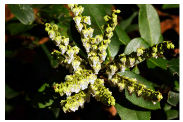
Pieris floribunda.

I was able to get out to remake acquaintances with Trailing Arbutus. After a few years of missing its fragrant flowers, I made a point to keep track of a nice patch and one of my visits was perfectly timed. This is one wild Erica that is more than reluctant to transplant so a home visit is a must. After a handful of unsuccessful attempts with our