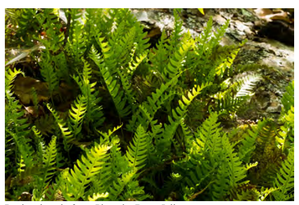
Rock polypody fern.