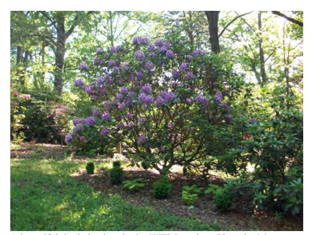
A beautiful rhododendron in the Willis' garden.

showed the most damage this spring? Unfortunately, the answer was quite easy to find—most of our damage was to the Japanese maples. Interesting to me was that both weeping and upright forms showed a range of damage from near zero visible damage to total death of the tree. We did dead tree removal, extensive tree shaping, and light limb removal. The pickup was filled and rounded with dead Japanese maple parts. (Since Mrs. Willis reads this article, I will not note the number of pickup loads that we did.) Under happier news, most of the rhododendrons and azaleas appear to have no severe winter damage. However, some plants only produced two or three blossoms. This was offset by really full bloom in others. The American boxwoods seem to be in good shape. The replacement by Green Mountain boxwoods of the dwarf English box lost to the boxwood blight appears to be working so far.