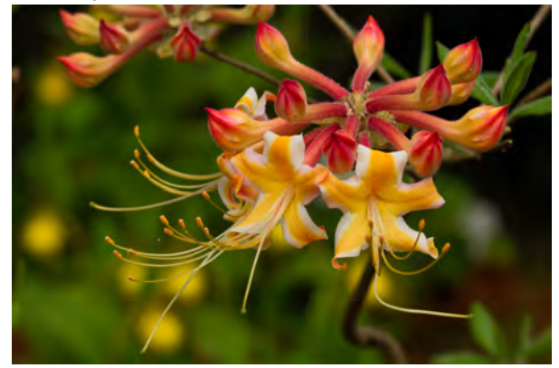
'Millie Mac'.

native wild Pieris , one now is luxuriant in the shade house. It bloomed from early March through mid-April. Since pollinators are largely excluded from the plants within this structure, flowers of azaleas, lady slippers and this Pieris (Pieris floribunda) last for many weeks.