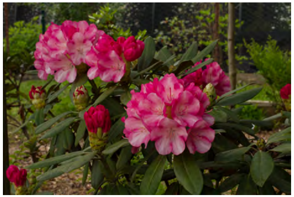
'Fantastica'.

outburst which needed attention and direction.