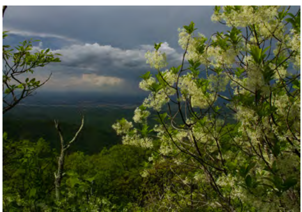
Fringe tree at Wintergreen.