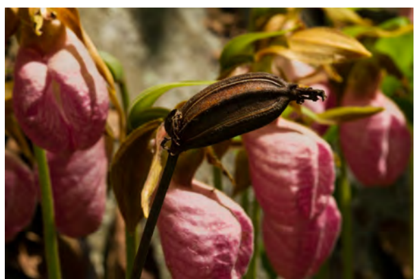
Pink lady slippers with seed pod.