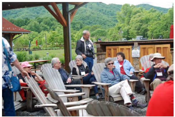
MAC members around the fire pit.