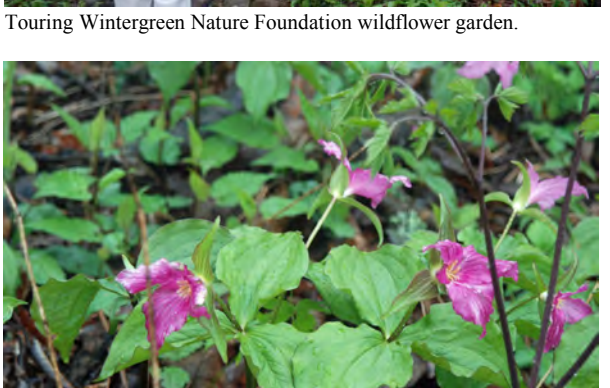
Trillium at the wildflower garden.