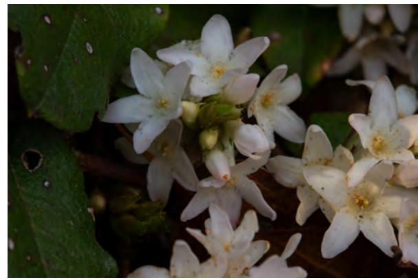
Trailing arbutus.