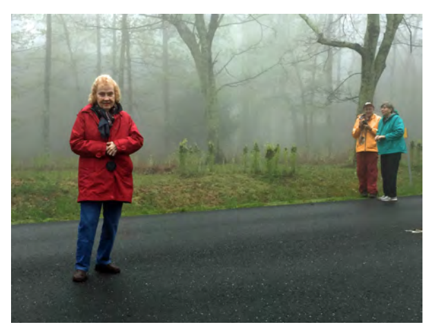
Color in the fog by the interrupted fern.