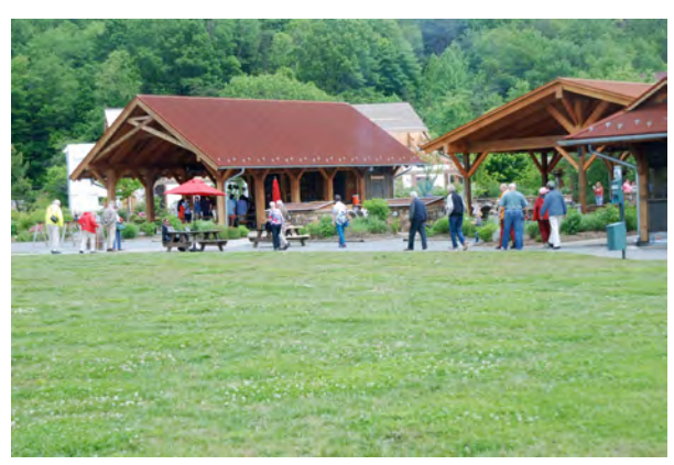
MAC members at Devil's Backbone Brewpub.