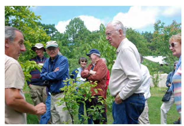
MAC members at Edible Landscaping Nursery.