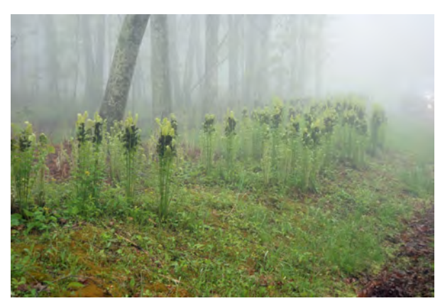
Ancient colony of interrupted fern at Wintergreen.