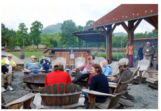
Sitting around the fire pit at Devil's Backbone Brewpub.