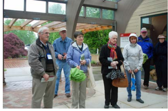
Part of our MAC group ready to tour JC Raulston Arboretum.