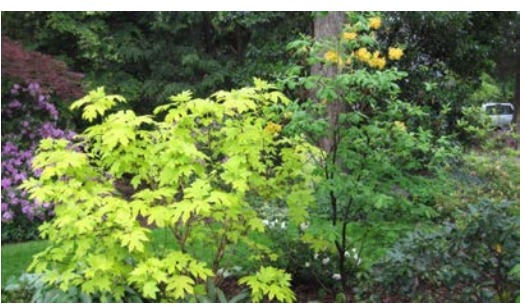
Hydrangea 'Little Honey' and deciduous azalea in Graham Ray's garden.