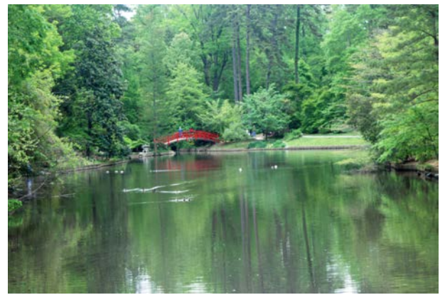
The pond and arched bridge in W.L. Culberson Asiatic Arboretum at Duke Gardens.