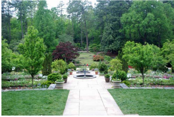
Looking towards the Historic Gardens and Fountain at Sarah P. Duke Gardens.