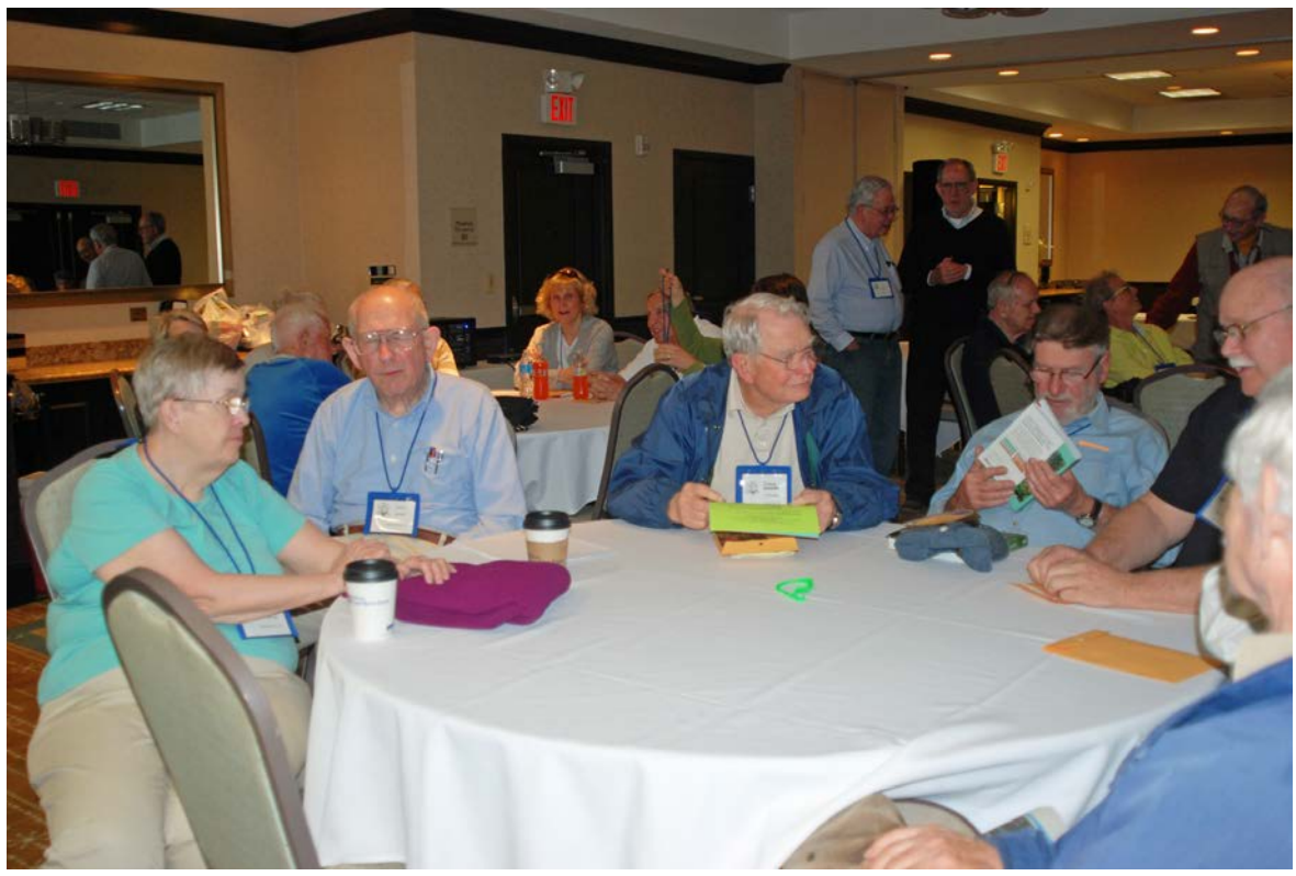
Waiting for the Friday evening program.