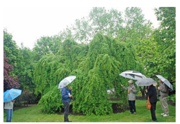
A rare weeping elm at JC Raulston Arboretum.