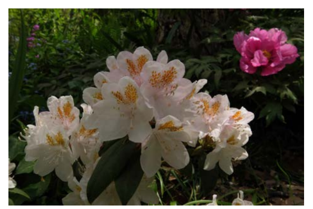
Rhododendron 'Yellow Eyes'

While elepidote rhododendrons were yet to come into anthesis, lepidotes and evergreen azaleas were in their prime. A favorite to me was Rhododendron "Yellow Eyes." Ron led us along pathways lined with woodland phlox (Phlox divaricata), hellebores, primroses of many colors and more. The entire time