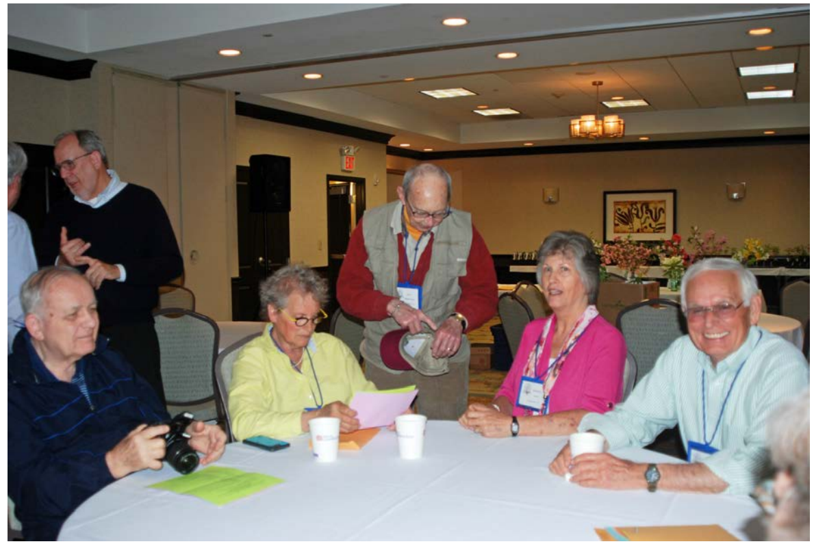
Waiting for the Friday evening program.