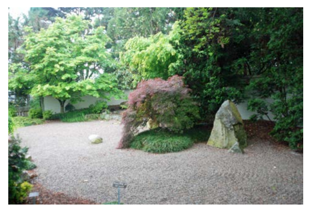
JC Raulston Arboretum Japanese garden.