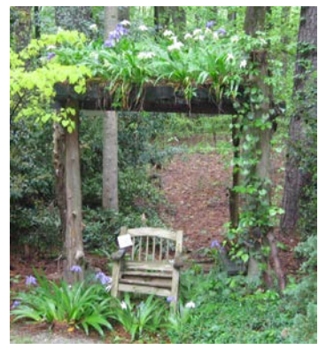
Japanese roof irises at Suzanne Edney garden.