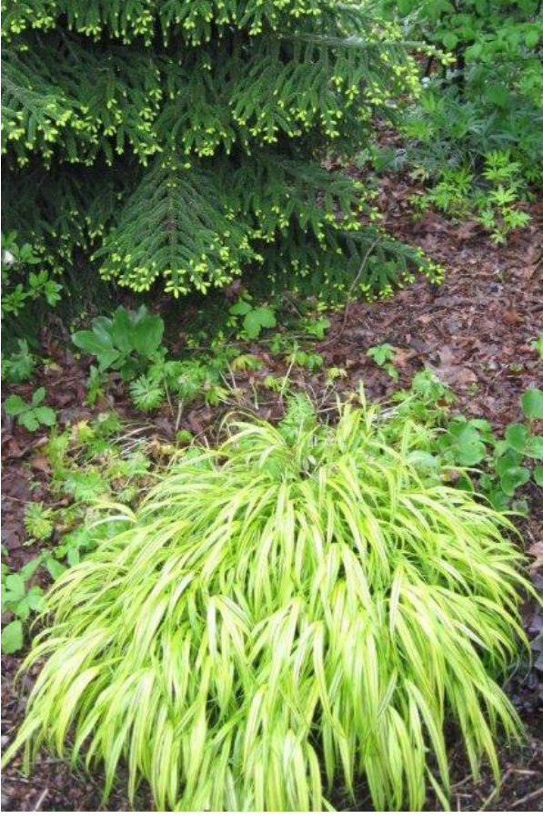
Gold form of Hakonechloa and yellow tips on new growth of a conifer.