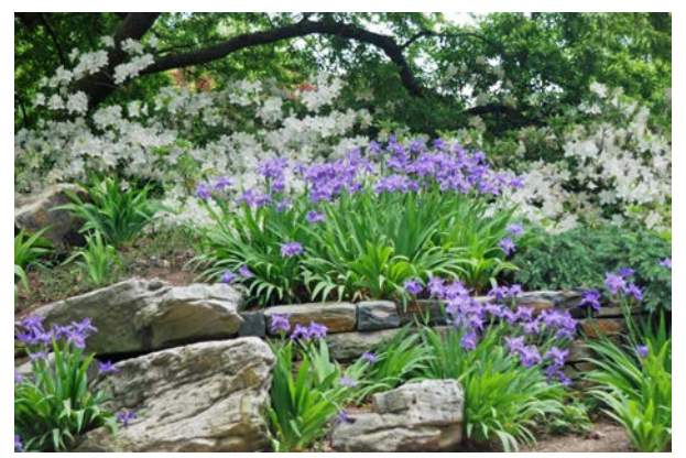
Irises and azaleas at Duke Gardens.