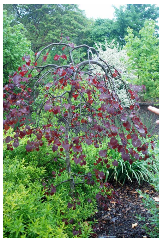
A weeping red-leaved Cercis at JC Raulston Arboretum.