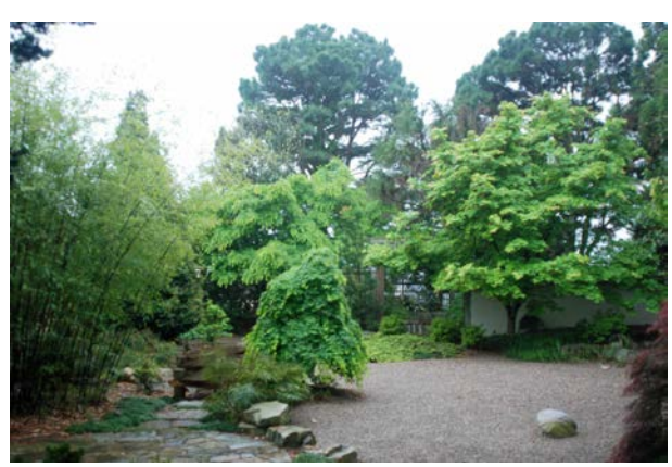
JC Raulston Arboretum Japanese garden.