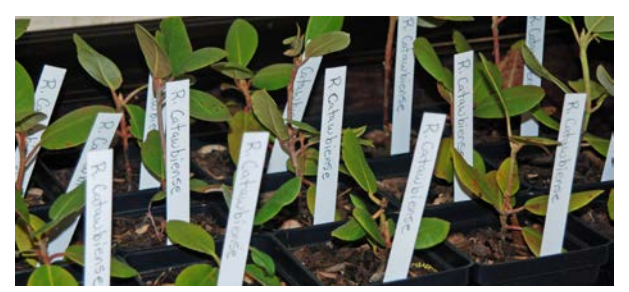
P4M plants.