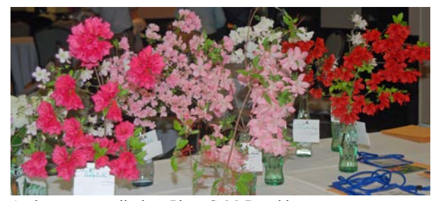
Azalea sprays on display.