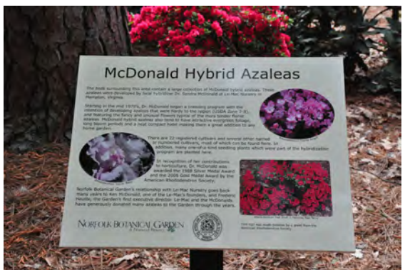
New sign for the garden.