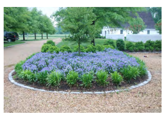
Scene at Providence.