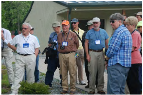
MAC members at Brent & Becky's rock garden.