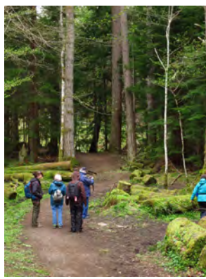
Reelig Glen in Scotland.