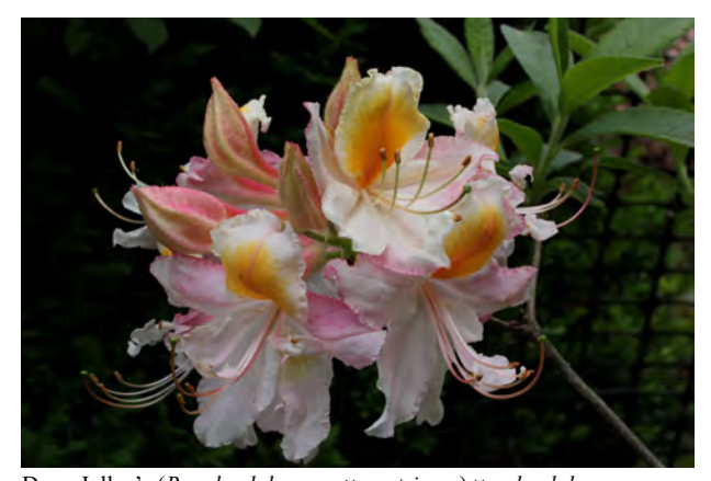
Doug Jolley's (R. calendulaceum \times austrinum ) \times calendulaceum.