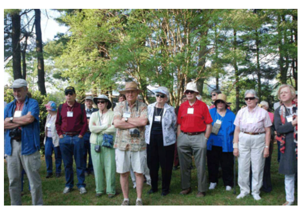
MAC members at Fox Haven Garden.