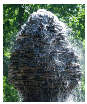
Gillenwater Garden and with a fountain in it.

Saturday was a wonderful day of garden tours. Jay Gillenwater arranged for us to see some very special gardens: Fox Haven Garden, the One of Jay Gillenwater's cairns nursery where we had