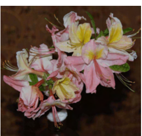
'Cecile' × 'Sweet Charity'