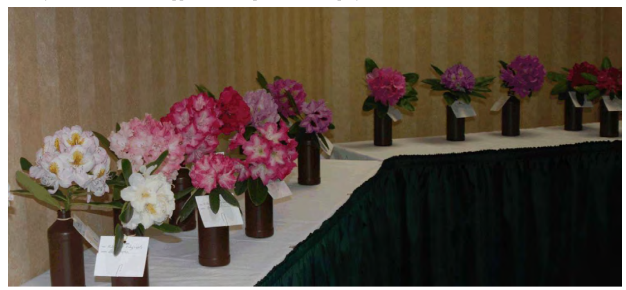
Some of the Flower Show entries.

On behalf of the US Forest Service's Cheoah Ranger District, I am pleased to present this certificate to the Mid-Atlantic Chapter of the American Rhododendron Society in recognition of your volunteer service on Hooper Bald. Hooper Bald is an important historic resource to the US Forest Service and the local community. The work that your organization id doing to remove encroaching trees and shrubs is ensuring that this area remains an open meadow bald. Furthermore, removing competing vegetation from around the many Flame Azaleas on Hooper Bald has provided an exceptional flowering display for Rhododendron enthusiasts and other