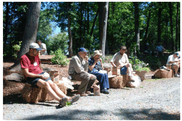
Lunch in the Gillenwater Garden.