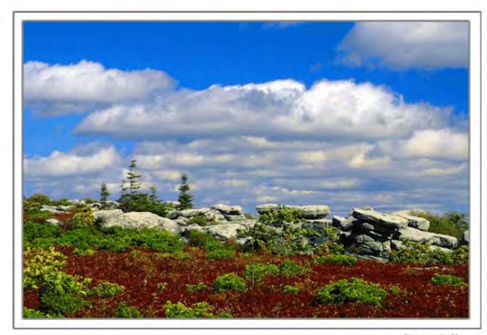
DOLLY SODS WEST VIRGINIA