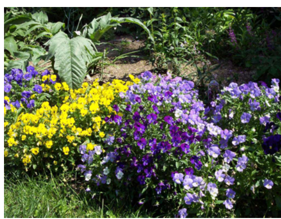
Color-changing viola Yesterday Today and Tomorrow' with darker purple viola, yellow viola and cardoon.