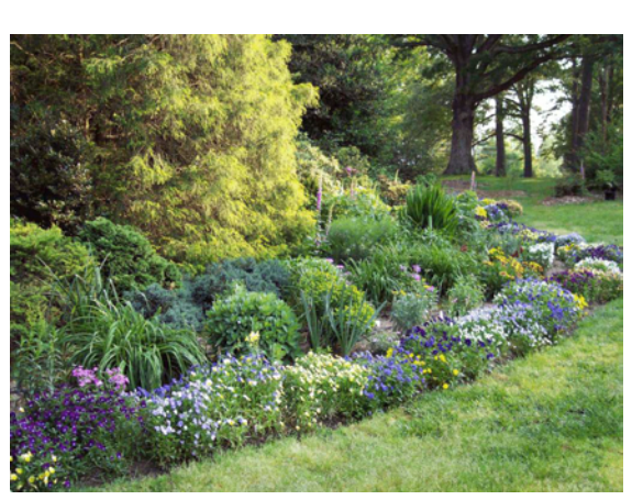
Mature viola/pansy border with yellow conifer. 5-21-07 W. Bedwell.