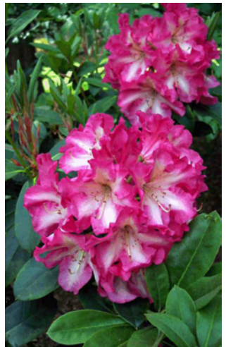
R. 'Consolini's Windmill'.